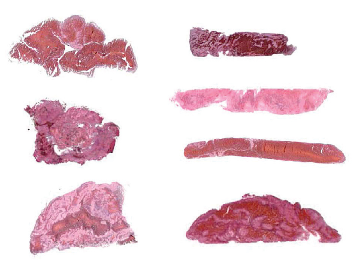
FIGURE 1. Light microscopy images of histological slices along representative retrieved cerebral thrombi. The histological slices were stained by hematoxylin-eosin and then analyzed for the RBS proportion. It can be seen from the images that the structural and compositional diversity among cerebral thrombi is high. All retrieved thrombi had a distinctly heterogeneous, laminated (multilayer) structure which involves the interweaving of compacted erythrocyte-rich (red) regions with thinner (pink) coatings containing a combination of complementary-linked platelets and a fibrin network.

used to obtain HU values along the thrombus from the corresponding CT image. Yellow line on the image is drawn along the thrombus and the symmetrical position of the normal MCA segment. Graphs in Figure 2A correspond to HU intensity profiles along both yellow lines: along the cerebral thrombus in Figure 2B and along the symmetrical section of the normal MCA segment in Figure 2C. For each HU, intensity profile was then calculated by average HU value HU_avg and HU value variability HU_var. Thus, each patient was characterized by these two CT parameters that were obtained for the occluded (occl) and normal (nor) MCA segment so that it became possible to calculate their absolute (diff) and relative differences (diff [%]), which are equal to: HU_avg_diff = HU_avg_occl-HU_avg_nor, HU_avg_diff [%] = 100·(1- HU_avg_nor/HU_avg_occl ) and HU_var_diff = HU_var_occl-HU_var_nor, HU_var_diff[\%] = 100 \cdot (1 - HU_var_nor/HU_var_occl). Table 1 shows CT as well as histological (RBC proportion), clinical and procedure parameters of pa-