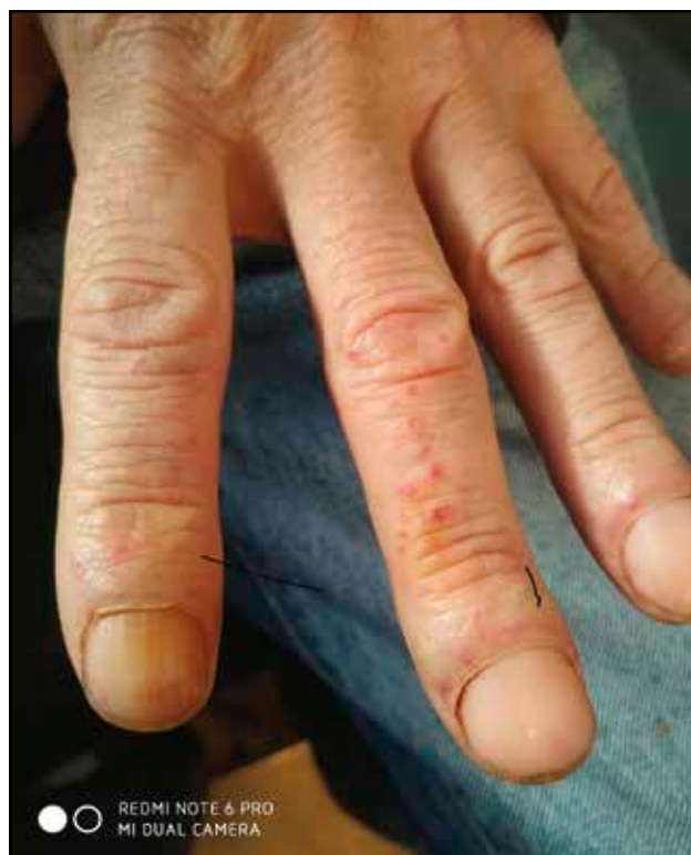
Figure 1. Cutaneous telangiectasias located at the fingers level.