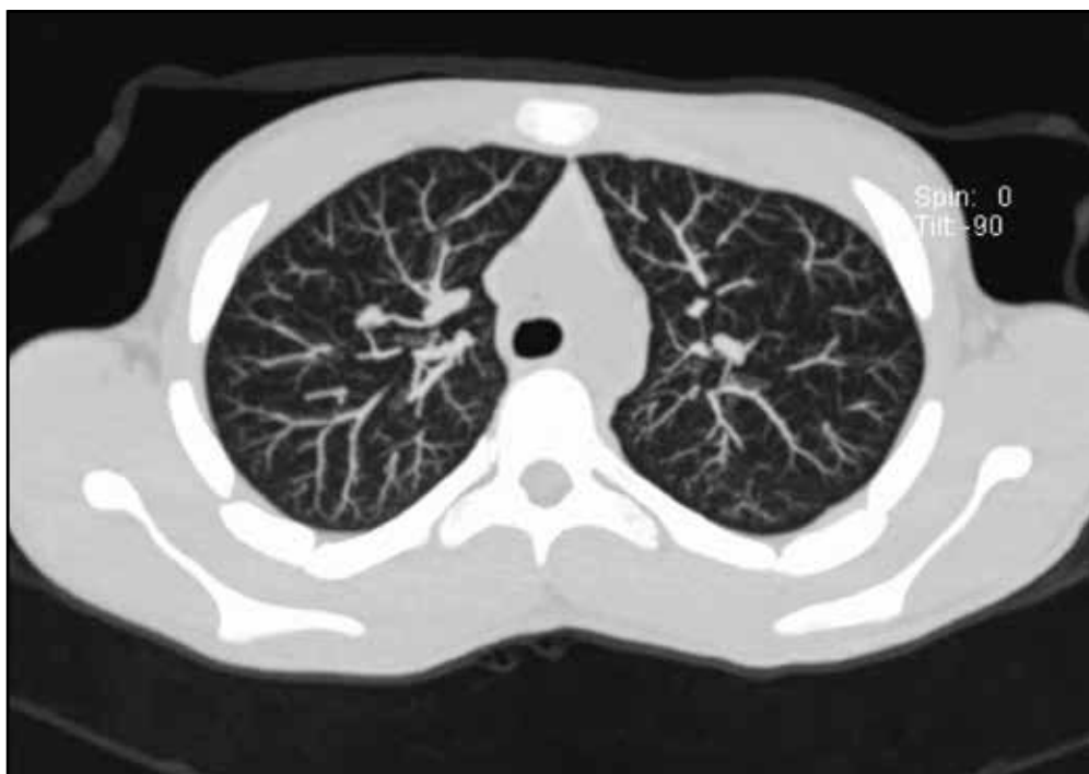
Figure 4. Lungs arterio-venous malformations in a patient diagnosed with HHT.

type II-like kinase 1 (ACVRL1), a type 1 TGF \beta and a bone morphogenetic protein (BMP) receptor. The type 1 hereditary hemorrhagic telangiectasia (OMIM 187300) is related to the mutations in ENG and mutations in ACVRL1 lead to type 2 disease