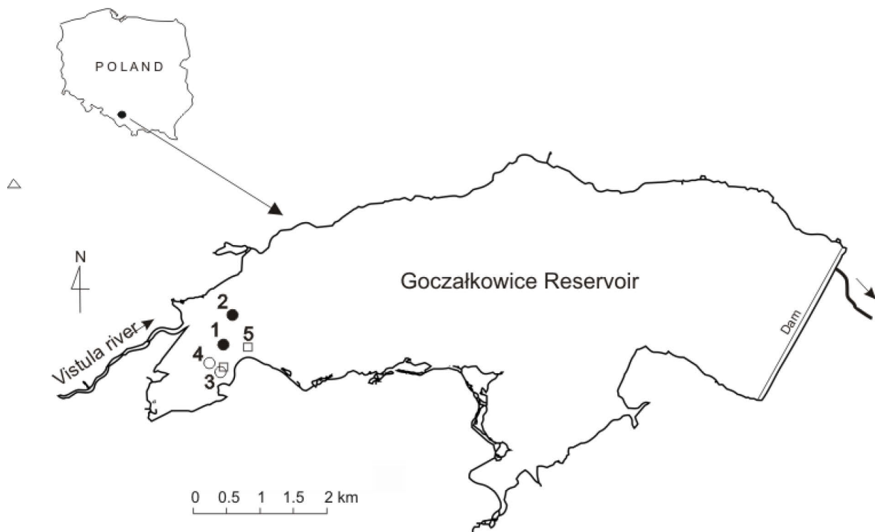
Fig. 1. Goczalkowice Reservoir. Sampling stations: 1 – water sampling station in the waterbird area; 2 – reference water sampling station; 3 – water and sediment sampling station near the gull colony; 4 – water sampling station outside the gull colony; 5 – sediment sampling station outside the gull colony

The reservoir supplies water to the Silesian agglomeration and is used for recreational fishing. The Goczalkowice Reservoir is one of the most important refugia of water birds in Poland and the Natura 2000 network site (PLB area code 240001). This reservoir is the most important breeding area of two threatened species in Poland: the Purple Heron